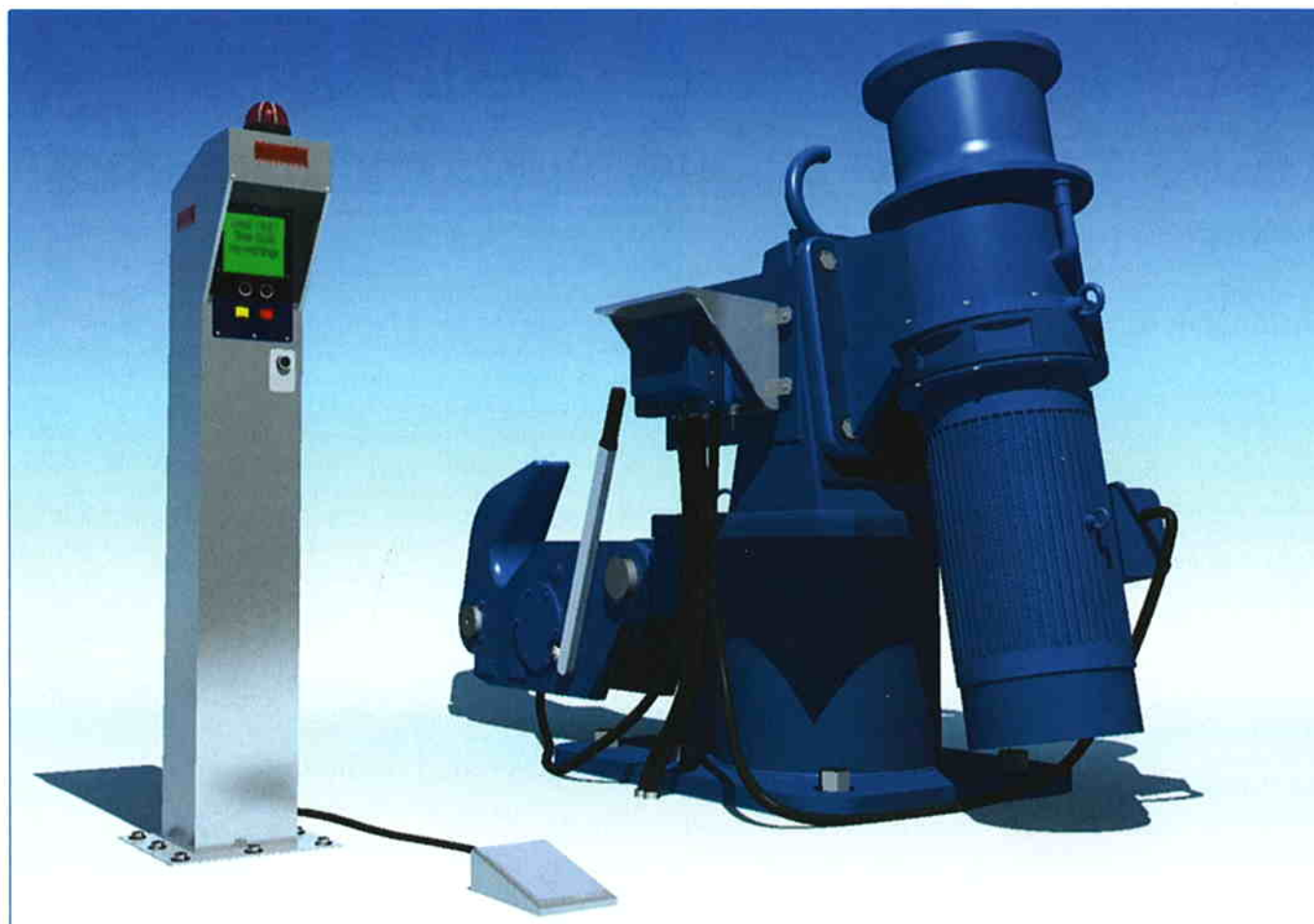
Figure 7. Safeguard panel for improved safety.