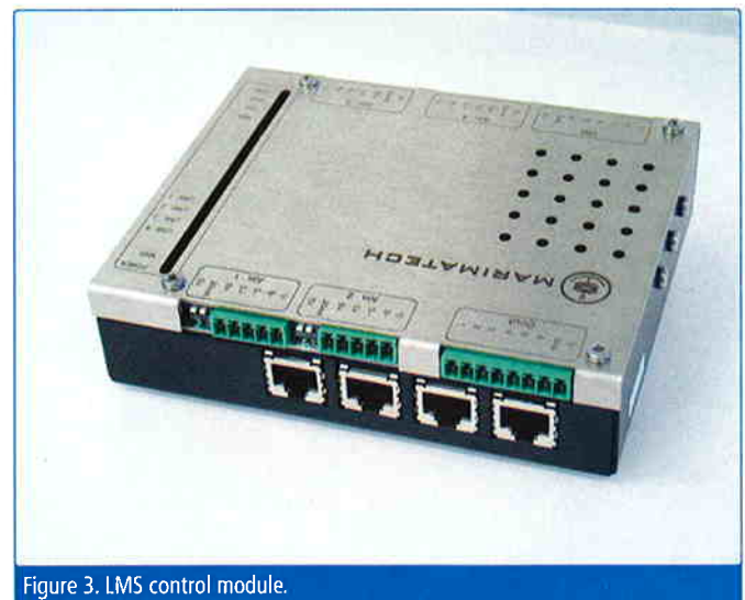
Figure 3. LMS control module.