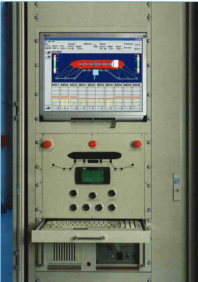
Figure 4. Remote control panel.