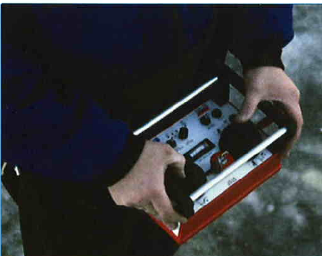
Figure 5. Remote control hand held EEx approved unit.

The control module is also controlling the remote QRH release activator, as well as watching the hook station sensors. Via the Ethernet LAN network it is possible to activate the release actuator. This function is done via the dedicated Remote control panel (Figure 4) that has a built-in redundant control module (LMS) that is independent from the system computer. This is to avoid accidental release. The security for releasing a hook is equal to that of the release of a missile from a warship. The old hardwired technology was not safe, and failures in hook station sensors and actuators