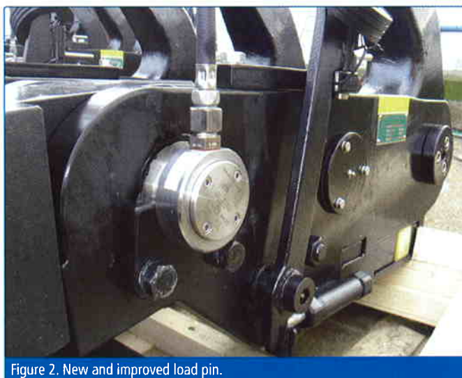
Figure 2. New and improved load pin.

Data delivered on the network is provided in real-time measurements as well as in extremes (Peaks) within given intervals. It can also be recorded in a network-connected computer that often is also used for berthing aid data as well as for environmental data. Should the network computer fail, the data is always, as a back up, available in the LMS control module (Figure 3).