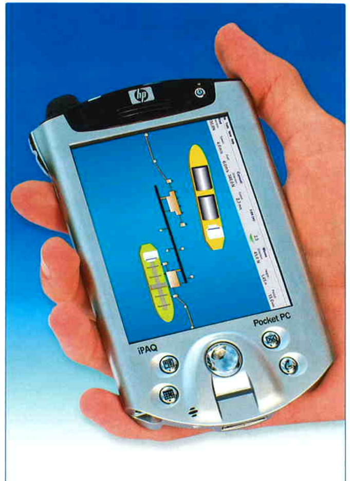
Figure 6. The QRH can be operated directly using a PDA.